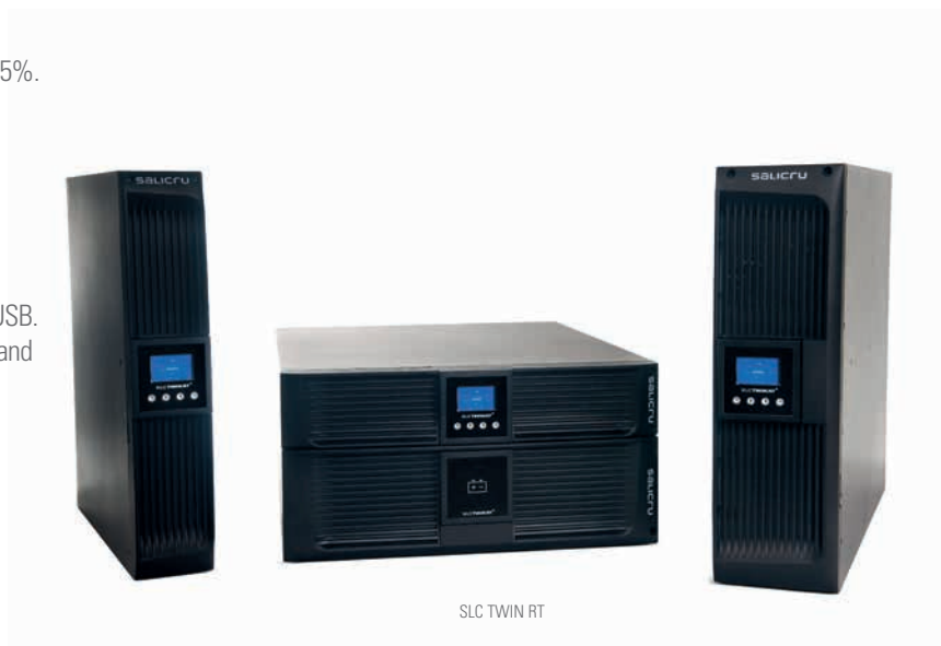
SLC TWIN RT