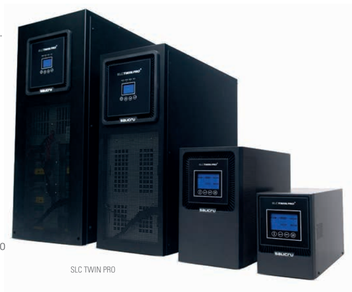
SLC TWIN PRO