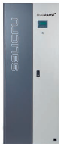
▶ SLC ELITE model