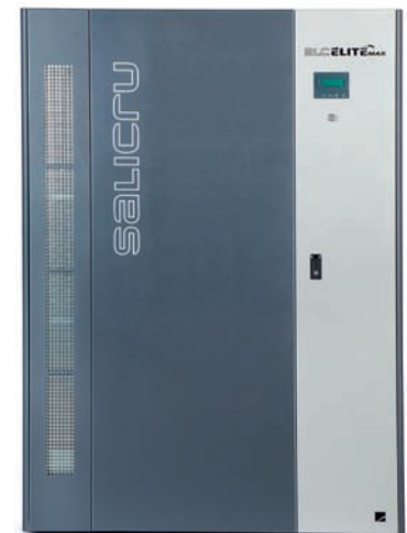
▶ SLC ELITE MAX model